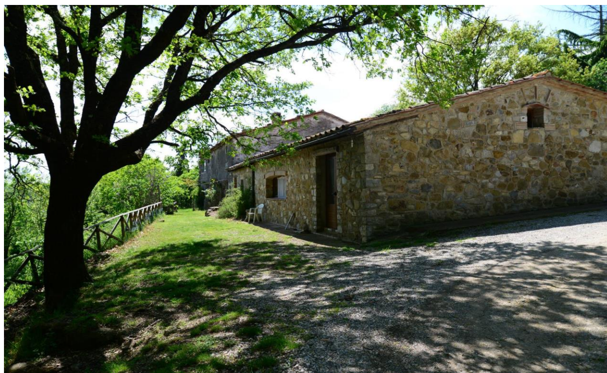
The house laboratory Il Cerquosino from the outside